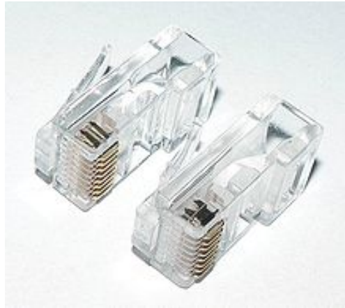
Figure B1 – Connectors for solid wire (top left) and stranded wire (bottom right) (unshielded connectors are shown for convenience, shielded connectors are recommended)

These two types of cable require different connectors since the conductor deforms differently in each case. If the appropriate connector is not used for a given cable there will likely be early failure due to oxidation, conductor breakage, or inadequate conductor contact pressure.